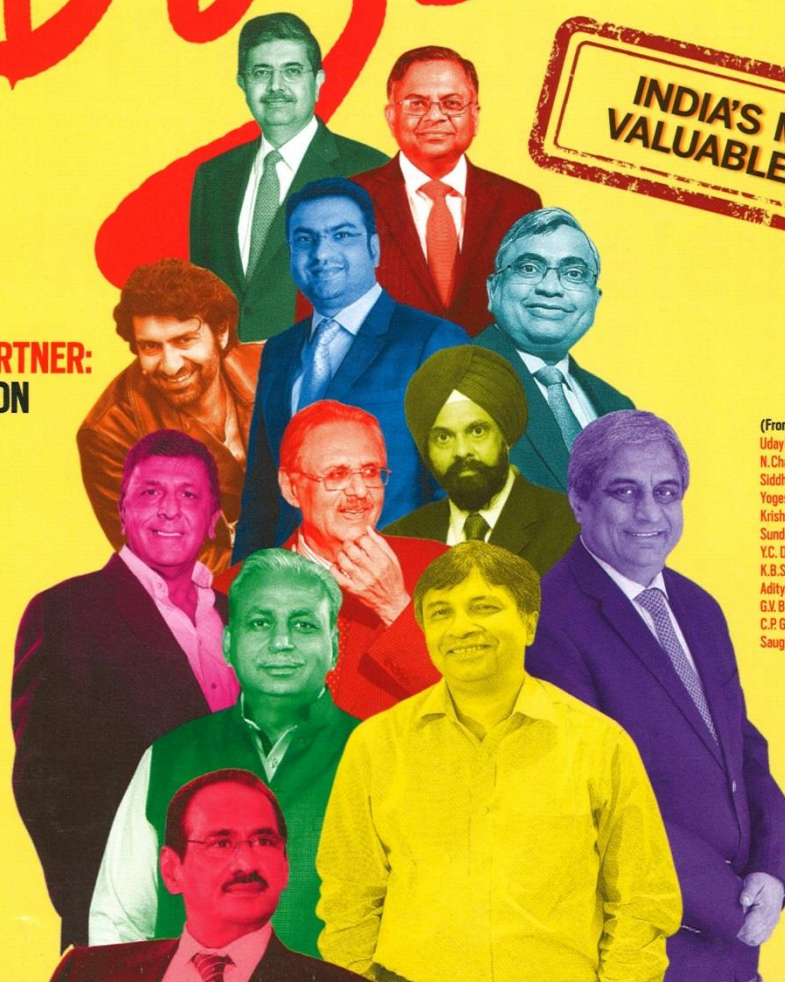
(From top left) Uday Kotak KOTAK MAHINDRA BANK N. Chandrasekaran TCS Siddhartha Lal EICHER MOTORS Yogesh Agarwal AJANTA PHARMA Krishnakumar Natarajan MINDTREE Sunder Genomol PAGE INDUSTRIES Y.C. Deveshwar ITC K.B.S. Anand ASIAN PAINTS Aditya Puri HDFC BANK G.V. Bhaskar Rao KAVERI SEED C.P. Gurnani TECH MAHINDRA Saugata Gupta MARICO